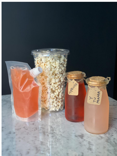
To-go cocktails and popcorn at Wonderbar in Beacon, New York WONDERBAR

If you happen to be in Beacon Friday-Sunday, don't miss Smoke On The Water , the Roundhouse Hotel's summer BBQ pop-up serving up everything from smoked brisket to racks of St. Louis ribs. The Patio restaurant's waterfall-side setting is a serene enough spot for delicious drinks and appetizers, just be prepared to wait a few minutes for a table once the evening rush hits.