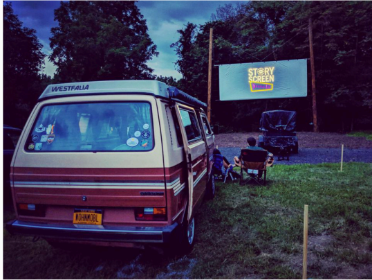
Story Screen, a drive in movie theater in Beacon New York.

There's something undeniably nostalgic about going to see a movie at the drive-in. The cars, the concessions, even the commercials that play beforehand. Not to mention the fact that in Covid-19 times, it's the perfect socially distanced activity to indulge in. I never realized how much I yearned for these simple pleasures until I learned that The Big Lebowski was being screened at a new Drive In theater up in Beacon, New York. It was as good of an excuse as any to break-up my regularly programmed weekend quarantine-routine and enjoy a bit of—dare I say— normalcy .