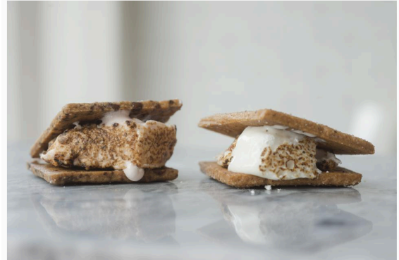
S'mores and frozen hot chocolate at Hudson Valley Marshmallow Company on Main Street in Beacon, New York.

Set in the Hudson Valley, Beacon is roughly 54 miles, or just over a 1.5 hour drive from New York City. Currently in the fourth and final stage of Covid-19 reopening , many restaurants are available for dine-in, however most have plenty of space for outdoor seating.