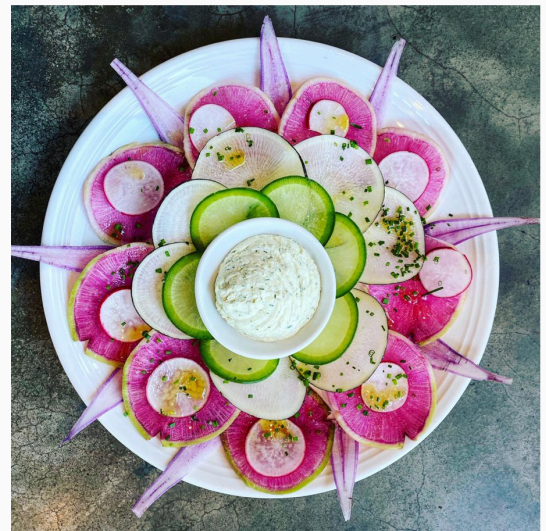
Lunch at The Roundhouse in Beacon, New York.